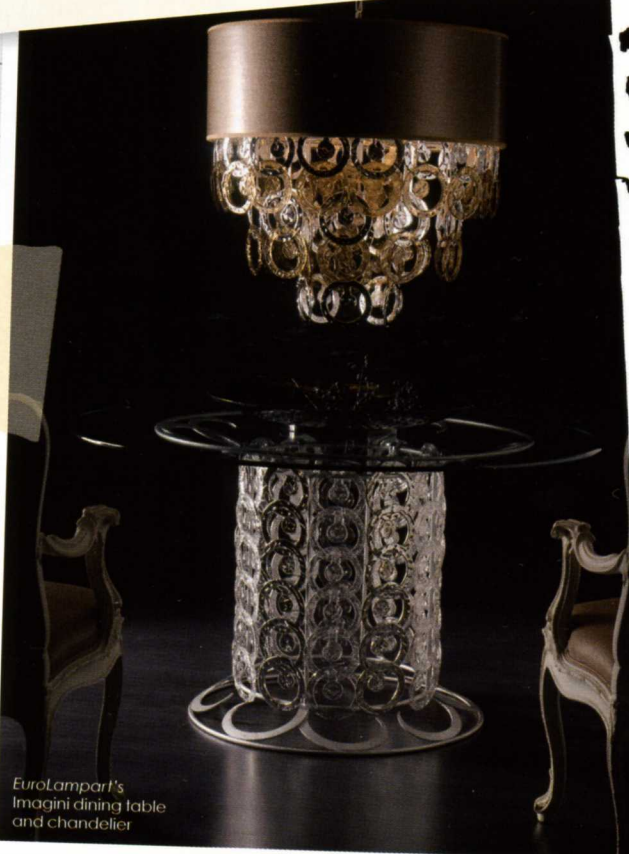
EuroLampart's Imagini dining table and chandelier

It's a show that promises to take you back to the true meaning of luxury: to what's rare and precious, made with skill, passion and, most importantly, in an era of high-speed everything, time.