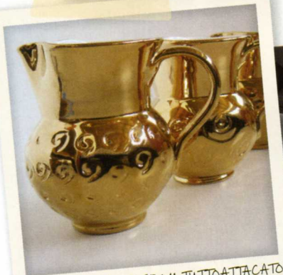
GOLD JUGS FROM TATTOATTACATO

Bringing together a carefully curated selection of artisanal Italian products, this is one show that design aficionados should not miss