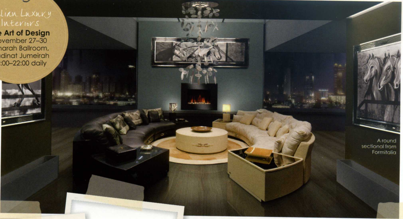
A round sectional from Formitalia

The Art of Design November 27-30 Joharah Ballroom, Madinat Jumeirah 14:00-22:00 daily